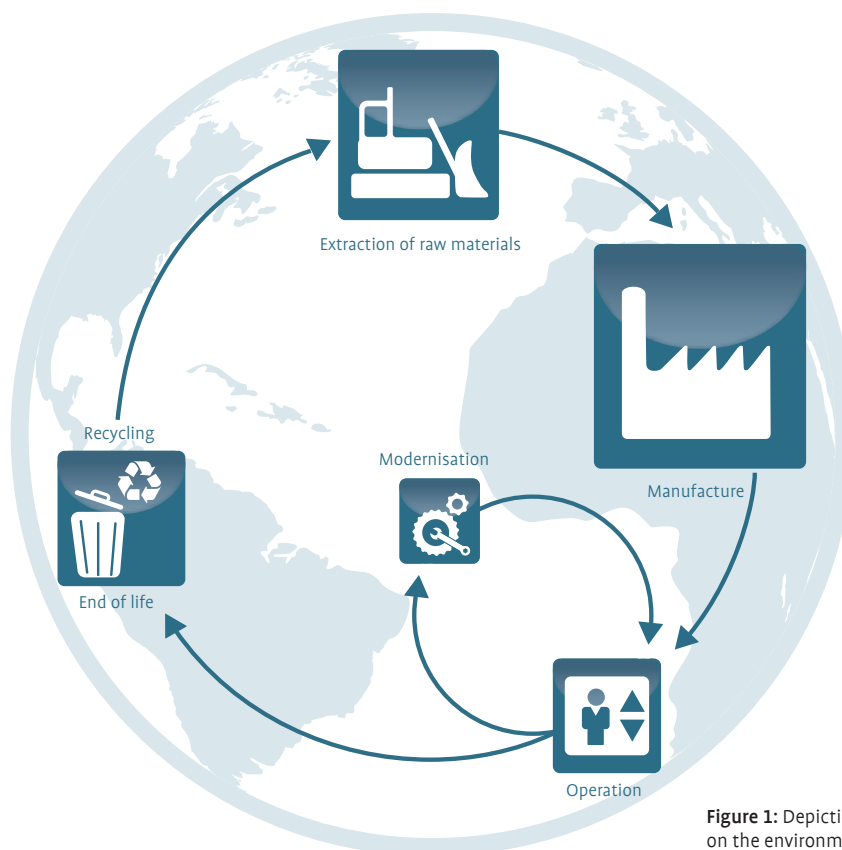
Figure 1: Depiction of the small impact of modernization on the environmental footprint: a modernization is more ecological than a replacement.